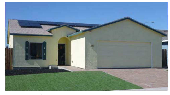
Habitat for Humanity